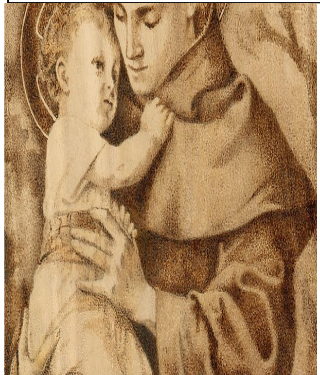
Feast of St Anthony of Padua is celebrated on June 13th