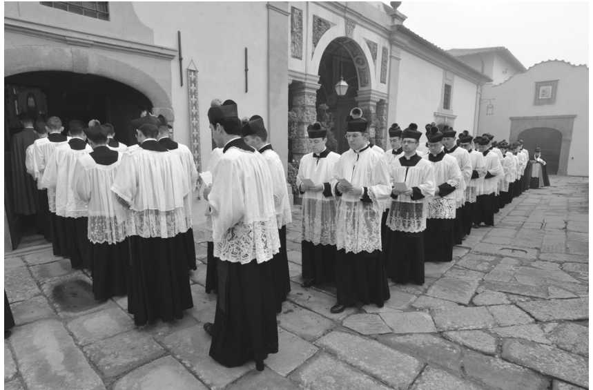
The Institute's St. Philip Neri International Seminary is located near Florence, Italy. Currently our Oakland Apostolate has two seminarians in formation there, and nephews of two parishioners. Please keep all seminarians in your prayers. This photo was taken on March 7, 2024, the Feast of St. Thomas Aquinas.